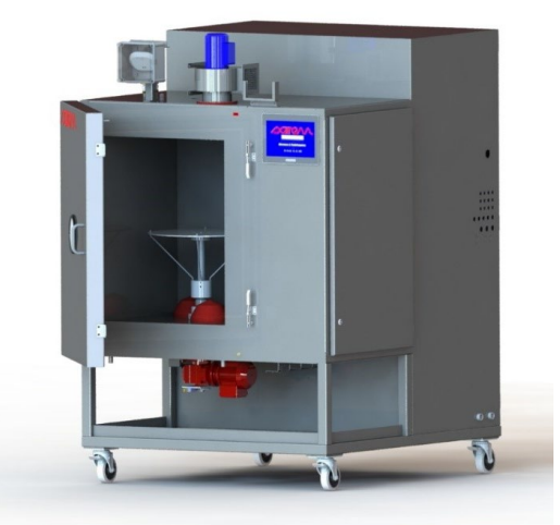
Figure 1 - Labotron FL12000 (SAIREM)

Microwave heating was conducted in a 2 x 6 kW, 2450 MHz pilot-scale system (Labotron FL12000, SAIREM, France) with a hot air system. The sample was placed inside the microwave heating chamber at the center. To ensure the homogeneity of the process, microwaves will be combined with a hot air system. A schematic view of the pilot-scale system can be found in figure 1. To achieve a stable air temperature for sample surface heating, hot air was circulated in the empty cavity for 1 h prior to the combined MW and hot air treatment.